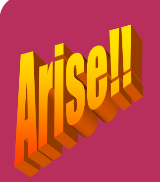
Isaiah 60:1 Arise, shine; for thy light is come, and The Glory of THE LORD is risen upon thee."

GOD has not forgotten you. HE has not left you. Reach for HIM, take hold of HIM. Never let HIM go. HE will be better than your best dreams, greater than your wildest imaginations. Learn HIS Ways, trust HIM, rest in HIM. With GOD, everything, everything is going to be alright!.